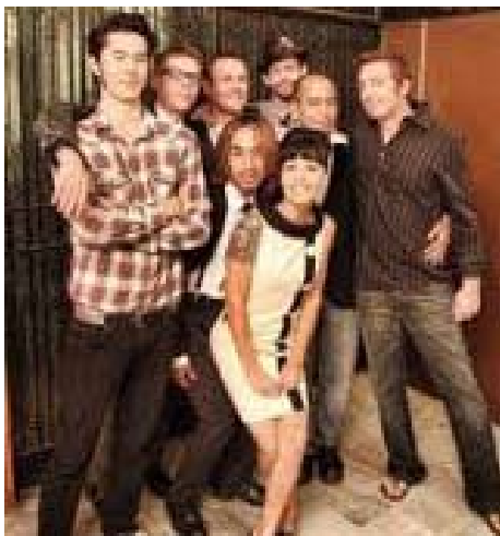
Soul Revival Sound System

Taiko Center of the Pacific is a school of traditional and contemporary Japanese drumming established in 1994 by Kenny and Chizuko Endo to preserve traditional Japanese drumming and to create new music for Taiko.