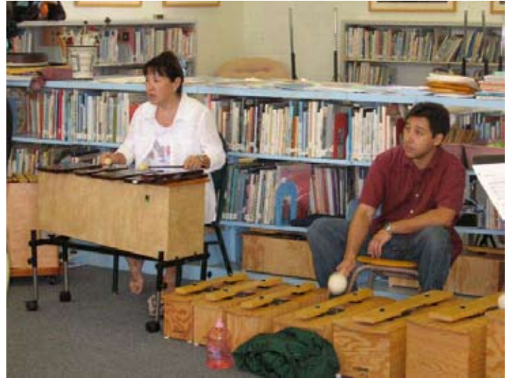
Hawai’i Orff Schulwerk Association

Downtown streets aren’t crowded on the weekend, so walk, bike, take The Bus or drive to HiSAM on Second Saturday ($3 flat-rate parking across the street at Ali’i Place; enter at 1099 Alakea St. Free parking available at City & County underground lot at Beretania and Alapai). Come see — it’s your art!