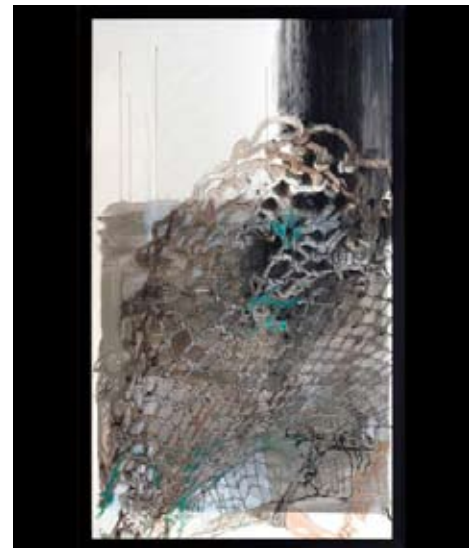
Falling Waterline, 2007, graphite, acrylic, oil on Dacron

Her current Public Art Commission, working title Trigger Picasso Energy is a photovoltaic glass canopy for the Hawaii State Art Museum Sculpture Garden that she will be creating in Peters Glasmalerie in Germany.